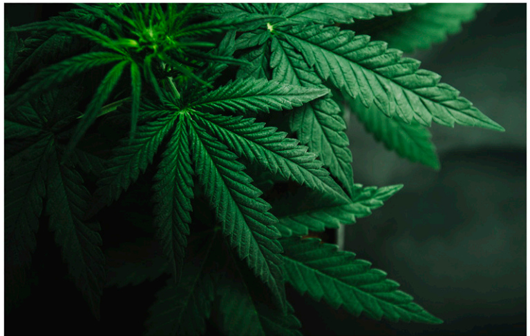
Most researchers stress that despite increasingly relaxed societal views toward marijuana, cannabis use—especially in adolescence—is not benign.

The question of safety for young users has taken on particular urgency in the United States, where, since 2012, 11 states and the District of Columbia have legalized the use of recreational marijuana by adults. Although it remains illegal for minors, the changing legal and commercial landscapes raise the possibility